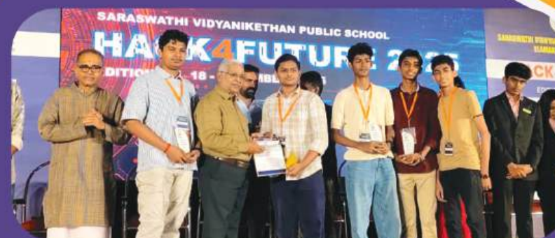
NATIONAL LEVEL HACKATHON

YES, WE KNOW THERE'S MORE TO LIFE THAN ACADEMICS BUT SKPS IS REALLY GOOD AT THAT TOO !