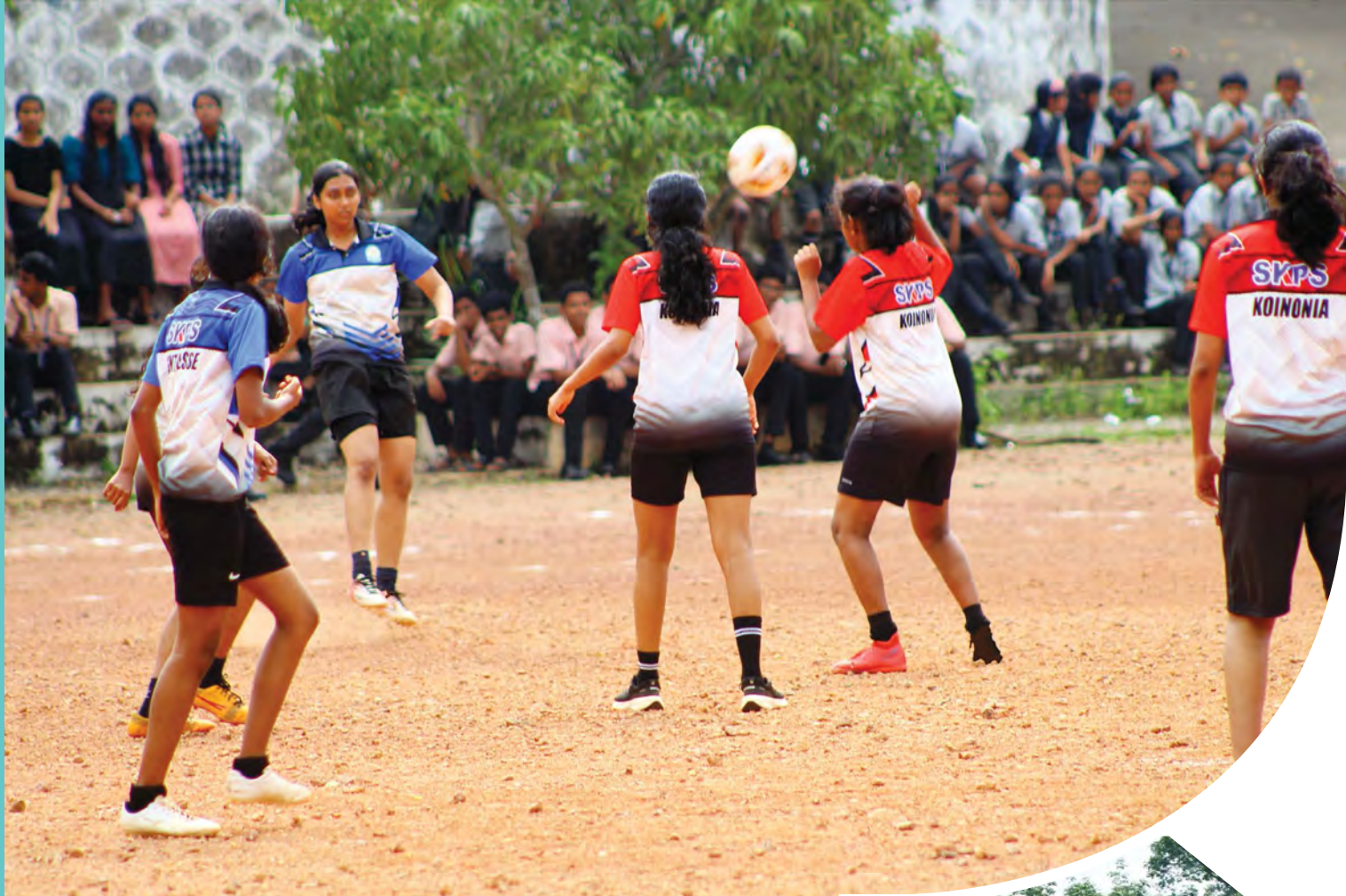
SKPS SPORTS ACADEMY