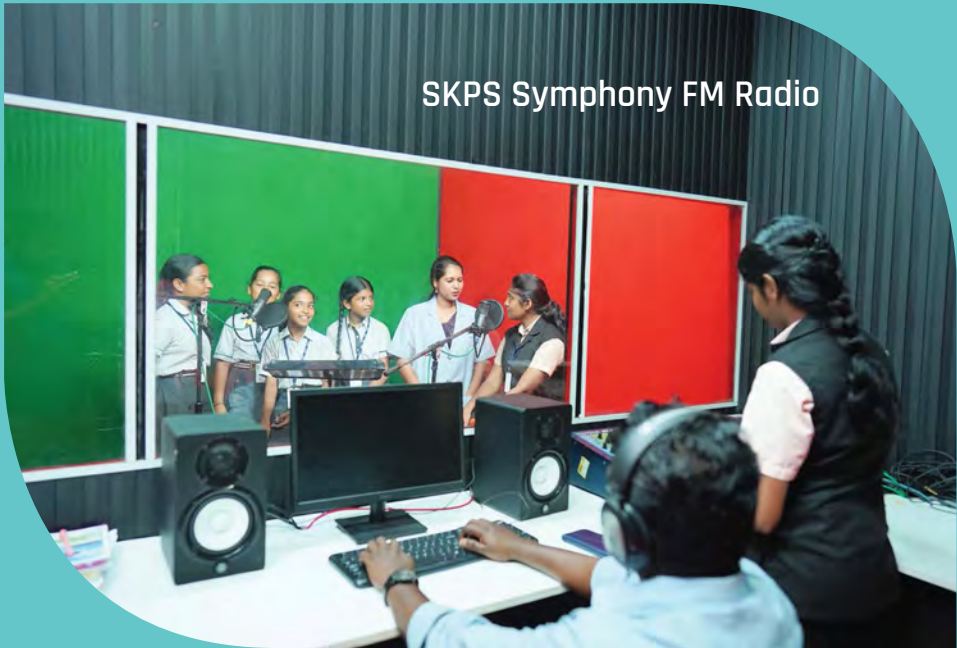
SKPS Symphony FM Radio

Wellness Room: Transporting back to Health and Ease